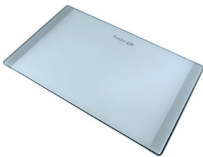
Glass chopping board 8633 300