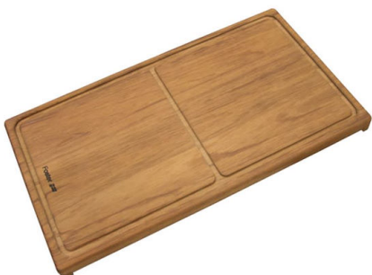
Iroko-wood sliding chopping board 8643 000