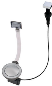
Space automatic waste fitting 8407 108